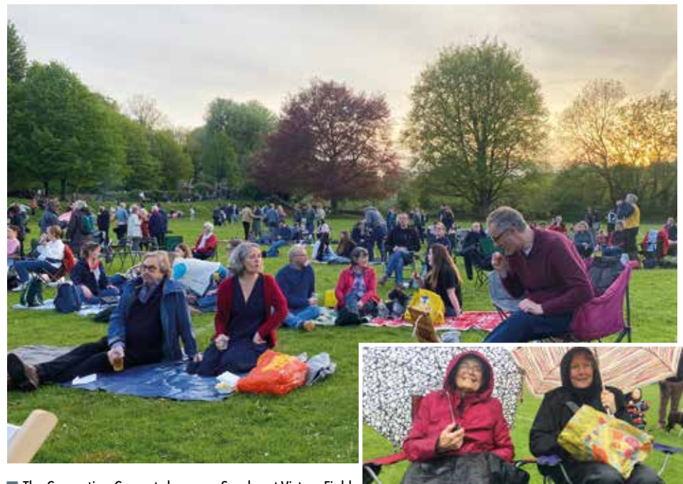
The Coronation Concert shown on Sunday at Victory Field attracted the crowds, while Saturday's weather failed to dampen the spirits of those who watched the celebrations on the big screen (inset)

• Turn to page 3 for more pictures and stories from the Coronation weekend.