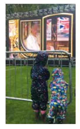
These two didn't seem to mind the rain on Saturday ... and then the sun came out on Sunday for the Preservation Trust's family picnic, right

fter Saturday's downpours, the rest of the Coronation weekend saw the sun shining on a host of community events.