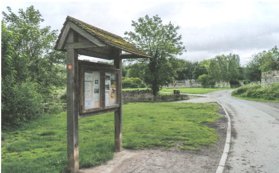
■ Barton Farm Country Park is one of the areas that will in future be managed by the town council