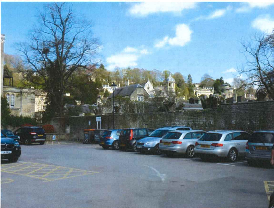
Existing view of the wall

St Margaret's Hall was built towards the end of the 18th century as a factory for dyeing wool and cloth. It was part of an acre of property owned by Charles Timbrell that also included Westbury House and its garden and St Margaret's House (now Timbrell's Yard).