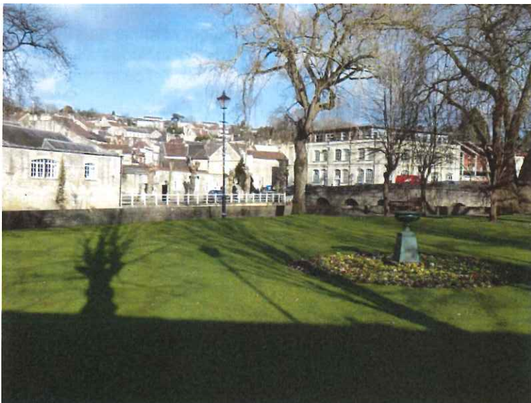
The Lamb Building and the wider townscape.

In the foreground the shadow of the wall.