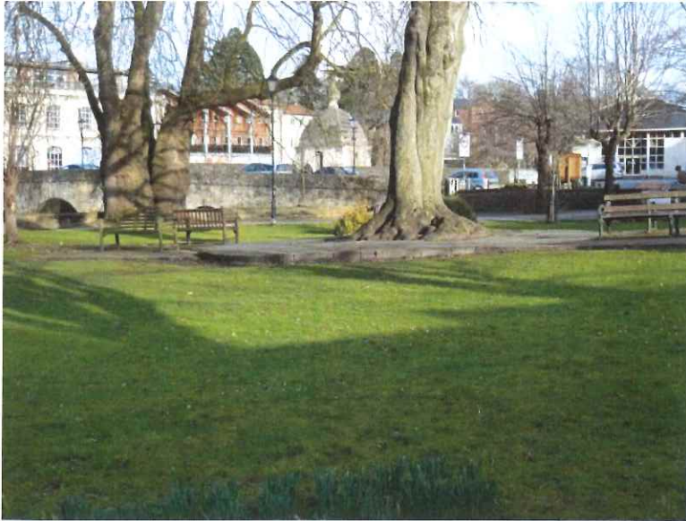
The view to the lock-up from within the garden