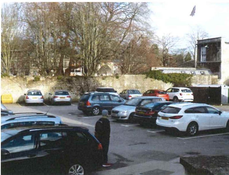
From McKeever bridge the views towards the town bridge are largely blocked by the wall to the car park.

In the foreground the shadow of the wall.