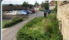
5 - Kennet Gardens Access Point