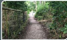
6 - Fitzmaurice School Entrance Route