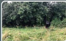
4 - Car Park Access Point