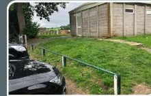
1 - Poulton Access Point