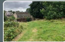
7 - Poulton Access Point