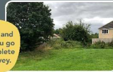
2 - Baileys Barn Access Point

Pick up a form and complete as you go round, or, complete the online survey.