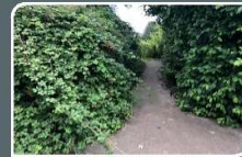
3 - Baileys Barn Access Point