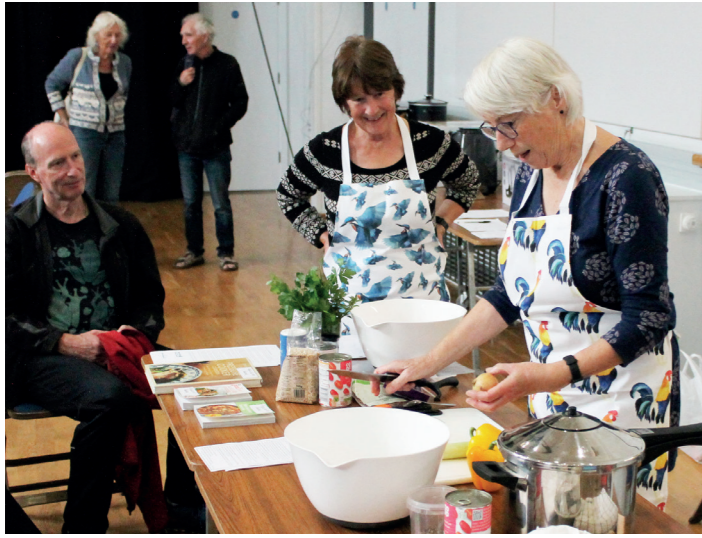
■ The recent low energy cooking event held at St Margaret's Hall featured cookery demonstrations using pressure cookers, air fryers and slow cookers