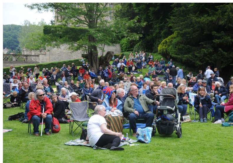
Pictured: Jubilee at The Hall

Sunday 5 June was also all about the sound of music in Bradford on Avon as he held a Night of Opera at St Margaret's Hall as well as Glastonbury Brass, Wiltshire Jazz Orchestra and a fantastic Punch & Judy show in The Hall.