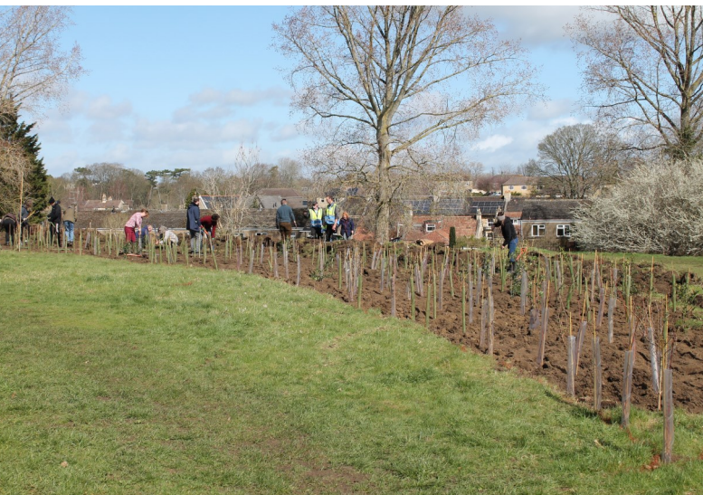
Pictured: One of the Plant Poulton Park community tree planting events