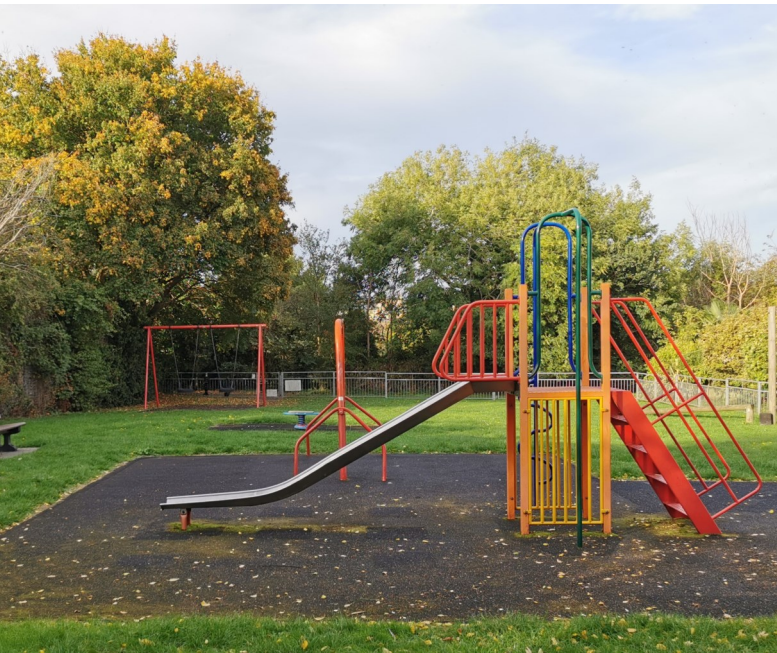
Pictured: St Aldhelm play area