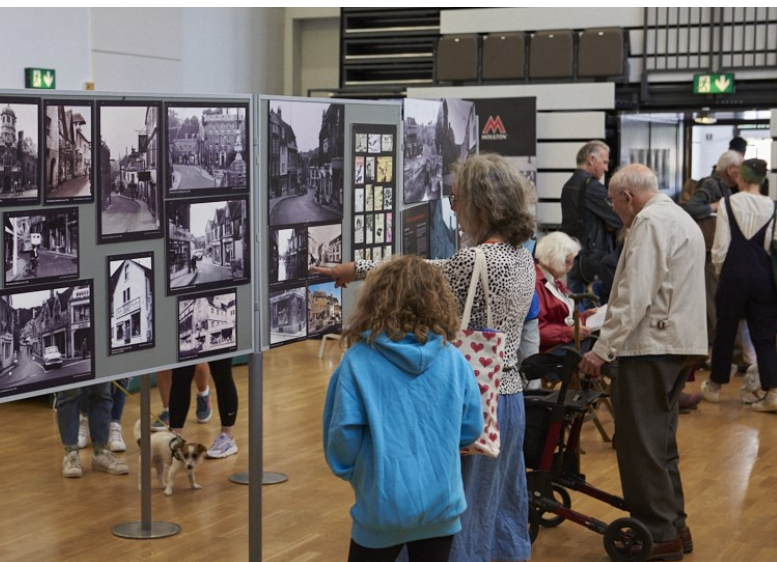
Pictured: visitors at the Jubilee Exhibition in St Margaret's Hall

More than 1,200 people visited St Margaret's Hall between 2 and 4 June 2022 to see the Jubilee Exhibition which showcased the history of the town over Her Late Majesty, Queen Elizabeth II's reign. The exhibition included audio, video and information boards for visitors — as well as a book stall.