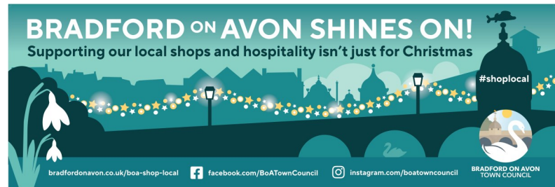
Pictured: promotional banner for the Shines On campaign

hospitality businesses and decided to leave the lights on as a show of support during a difficult economic period.