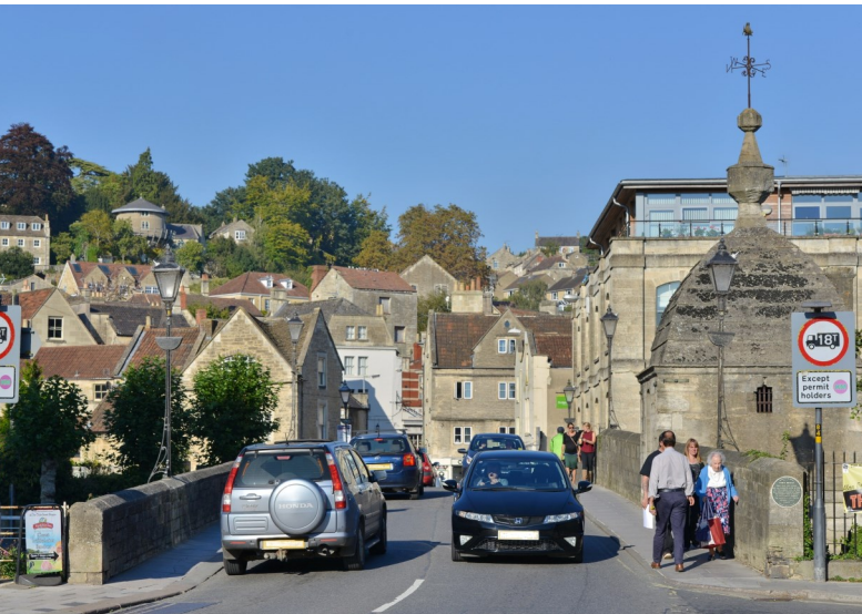
Pictured: photo of traffic coming across the Town Bridge