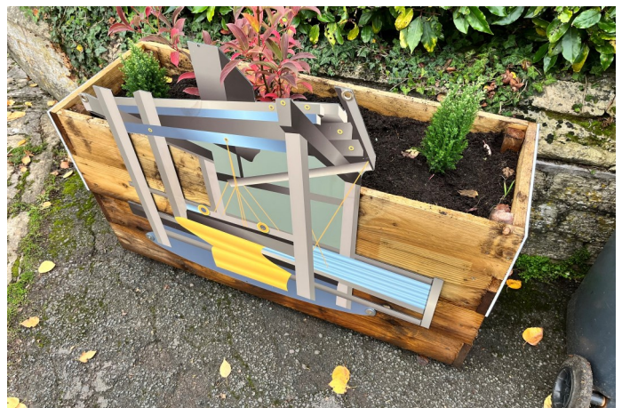
Pictured: 1 of the Industrial Heritage Trail planters showing a loom

While the information towers can be found at St Margaret’s Car Park, Station Car Park and the Canal & Rivers Trust car park.