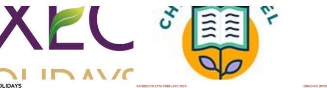
Pictured: landing page for BoA Shop Local on bradfordonavon.co.uk