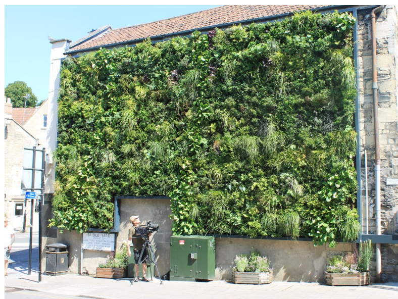
Pictured: the Living Green Wall when it was first unveiled to the press and public

In December 2022, ANS Global (who installed the Living Green Wall) placed their Bradford on Avon project at the top of their projects for the year – beating out Tottenham Hotspur Stadium.