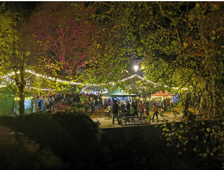
Pictured: people in Westbury Garden enjoying the Christmas Lights Switch On