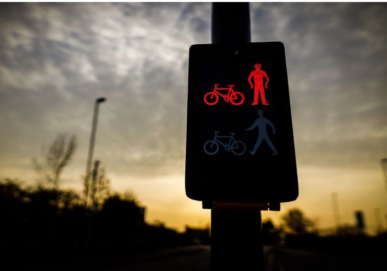
Pictured: a photo of a crossing