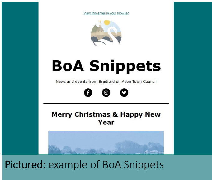
Pictured: example of BoA Snippets