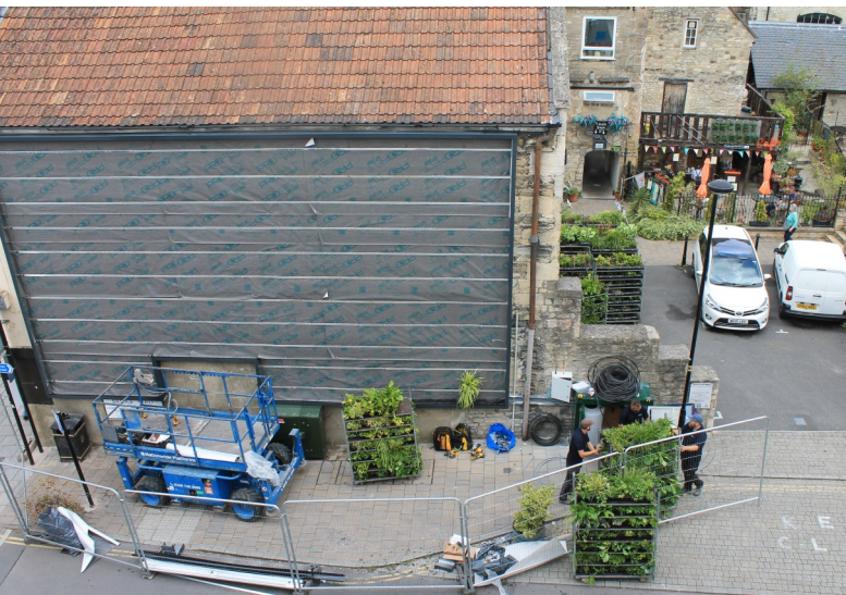
Pictured: The Living Green Wall under construction

The Climate & Ecological Emergencies are at the heart of everything the Town Council does