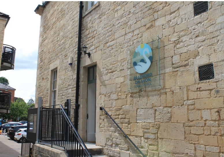
Pictured: new Bradford on Avon Town Council offices at Kingston House