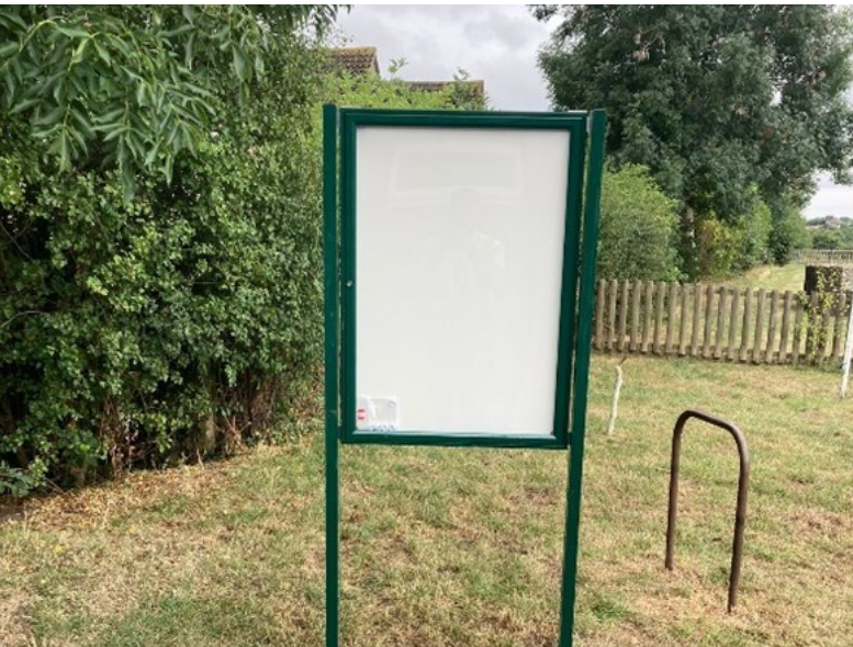
Pictured: new noticeboard in Poulton Park