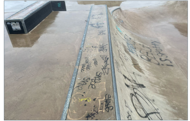
This is an example of some of the less offensive graffiti we encounter.

Over the past few months, vandalism in the town has risen – including damage to the play areas, bin fires or graffiti.