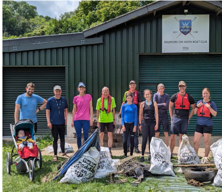
Boat Club volunteers after collecting rubbish from the river.

On behalf of the town council, thank you to everyone who took part in the litter pick and helped clean our river.