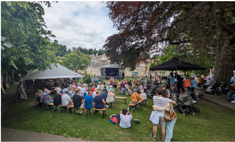
The crowd in Westbury Garden on Saturday 31 May.

We also have to say a huge thanks to our volunteers, venues and performers. It was our biggest festival yet – stay tuned for the dates of next year's event!